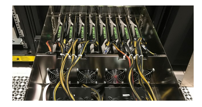
Figure 2.1: IBM Cracking Rig [PC]

But even with the development of new adaptive one-way functions for storing passwords [OPSCS] the problem of storing and verifying passwords is still nontrivial. These new functions require a server to invest more CPU power and memory to create a secure password in a process which is slow by design to counter fast cracking rigs. In contrast to the cracking rigs which benefit from a constant increase of performance in GPU processing power, servers are mostly staying at their level for years. Especially cheap or free services are not able to afford servers powerful enough to use reasonable settings for those new functions [TRB].